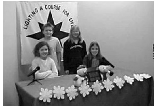
Pictured: CHES Broadcast team